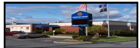
Melvin Roads Post 1231 200 Columbia Turnpike Rensselaer, New York 12144